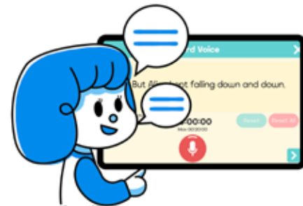
② Press the subtitle.