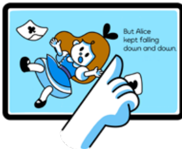
③ Record your voice for the subtitle.